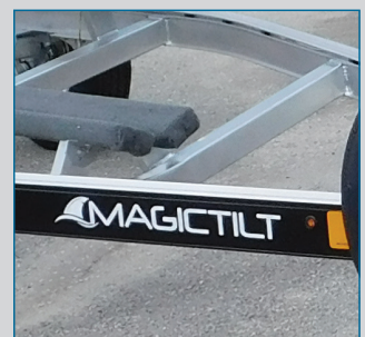
Full Trailer Wrap