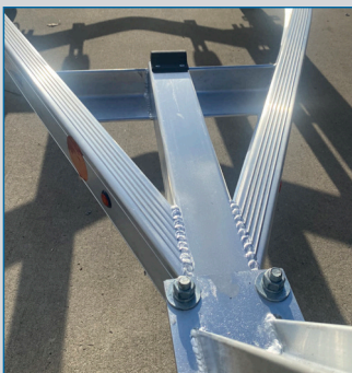
Full Welded Construction