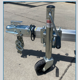
Jack Standard on All