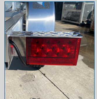
LED Lights w/ Cover

Minimum order of 12 trailers to qualify for pricing listed. Mix and match any models to equal total order, includes aluminum and galvanized, PWC and DWC model mix. Additional freight charges may apply to orders shipped to locations greater than 400 miles from Edgewater FL. Single unit and small order pricing available.