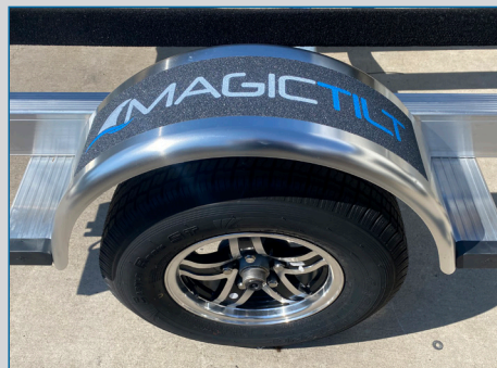
Alum Fenders & Steps