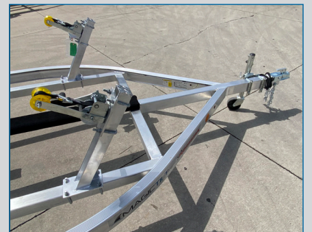
Full Body Frame